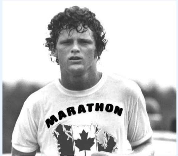
One day, millions of students and educators, thousands of schools, one dream—a world without cancer

The Terry Fox Foundation has raised over 400 million dollars worldwide for cancer research. This money has been used to produce better treatments for all types of cancers.